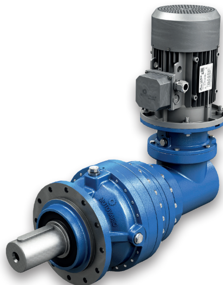
BEVEL HELICAL GEAR REDUCERS